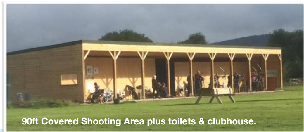
90ft Covered Shooting Area plus toilets & clubhouse.

Many of our excellent indoor facilities are as a result of the community work we continue to do and we ensure we offer a product that generates a healthy demand.